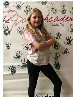
Audra Garden City