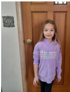
Ali Ness City